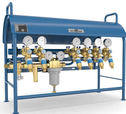
with 4 or 6 outlet points